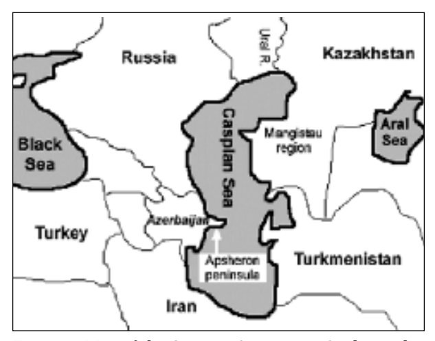
Figure 1. Map of the Caspian Sea region. Seal samples were collected from Kazakhstan, Turkmenistan, and the Apsheron peninsula, Azerbaijan.

(Table), no consistent gross lesions were found. However, microscopic lesions, including bronchointerstitial pneumonia, encephalitis, pancreatitis, and lymphocytic depletion in lymphoid tissues, were seen in these and four seals found in Kazakhstan in May. Multiple intracytoplasmic